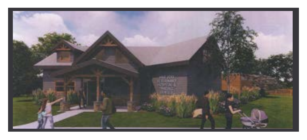
*This is a conceptual design; actual design will vary