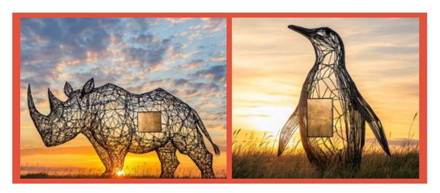
*This is a conceptual design; actual design will vary